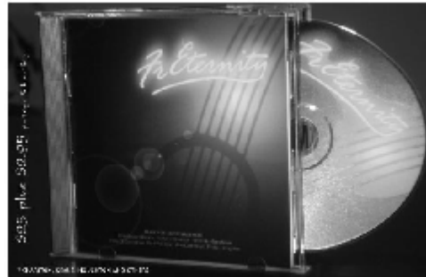
A unique CD collection of Australian compositions for Guitar Ensemble

Thomas Mace, in his seventeenth century book "Musicke's Monument," suggests that to tune a lute, tension the top string until it nearly breaks, then tune the rest to that. He also advises "to keep the lute under the bedclothes for best protection, but to beware, on returning home in one's cups, from the tavern, with a doxy...". Sound advice indeed.